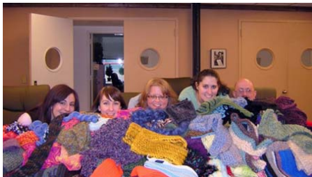
Coat Drive Collection for NY Cares

Just between us.....Fashion will be back as well as Architecture and Legos. Keep an eye out for new courses such as Improv Comedy and Poetry. It should prove to be a wonderful Spring.