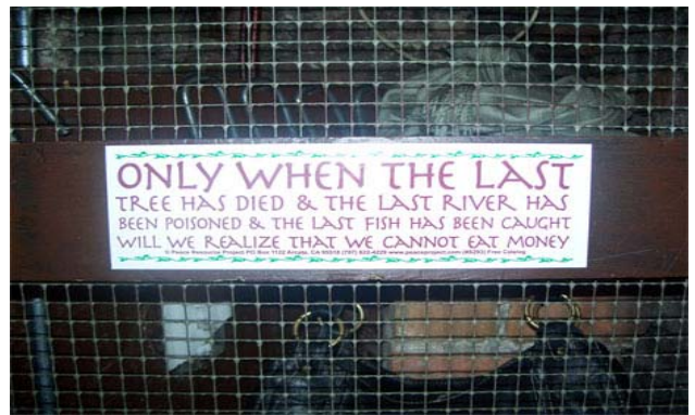
Message to the World from Mandiba Restaurant