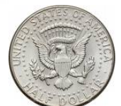
Kennedy Half Dollars